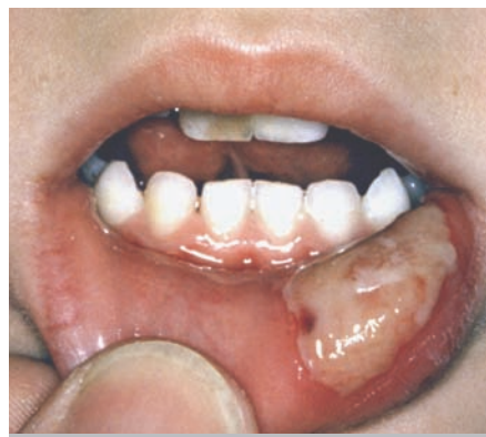
Figure 1 Traumatic injury to lip while soft tissue still anesthetized.

Anesthesia of the supporting tissues—both bone and soft tissue (lip, tongue, chin, nose, and cheek)—usually persists for several hours after pulpal anesthesia has been lost. 2-4 Though normally of minimal concern, residual soft tissue anesthesia (STA) may result in injury, either self-inflicted (eg, biting) or secondary to thermal or chemical burns. This is of particular concern in pediatric patients who may chew a bitten lower lip because it is painless, causing ulceration of the oral mucosa (Figure 1). One recent study measured a 13% incidence of injury after mandibu-